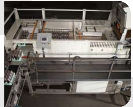
A-880 Series Mid-Speed Case Palletisers Smooth, quiet performance and optimum productivity