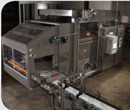
A-680 Series Floor-Level Case Palletisers Compact, floor-level infeed machines for end-of-line applications

The result of more than 60 years of palletising experience, the Alvey range of palletisers and depalletisers has evolved to meet any line's needs. Alvey remains the world's leading palletiser brand offering flexibility, reliability and industry leading speeds (more than 220 cases per minute). Alvey palletisers and depalletisers can be configured for virtually any pattern, product packaging, or container, including cases, totes, bails, trays and boxes.