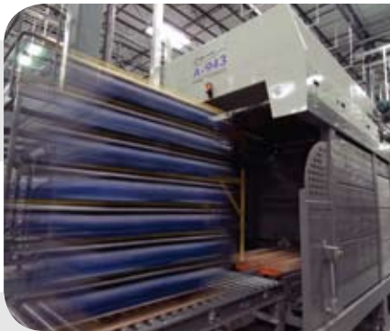
A-910 and A-940 Series Very High-Speed Case Palletisers Leading the industry in speed, flexibility, and reliability