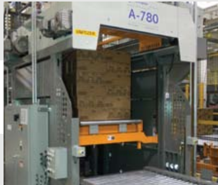
A-780 Series Low-Speed Case Palletisers Compact, low cost, mid-speed machines well suited to single- or multi-line applications