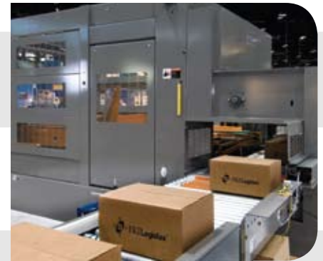
GS100 Series Palletiser A cost-effective alternative to manual palletizing

FKI Logistex offers a full range of case- and pallet-handling conveyors, conveyor systems, warehouses, distribution centers, postal and parcel operations, airport baggage handling operations, and manufacturing facilities.