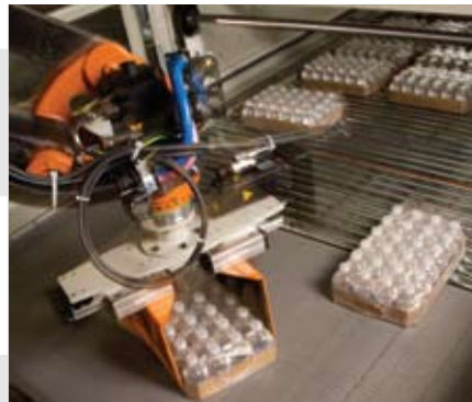
Robotic Palletisers and Depalletisers Stand alone robotic palletiser and hybrid robotic palletising solutions